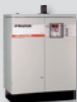
Self-Service Wash Station, oil-heated, gas-heated or electrically-heated