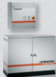
Wall-mounted High pressure cleaner, oil-heated, gas-heated or electrically-heated