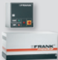
Wall-mounted High pressure cleaner, unheated