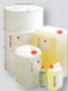
Accessories and spare parts