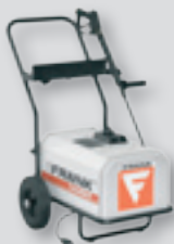
Mobile High pressure cleaner, unheated