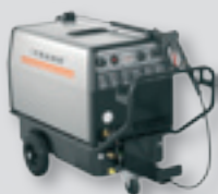
Mobile High pressure cleaner, oil-heated or electrically-heated